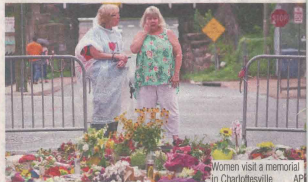
Women visit a memorial in Charlottesville

He continued: "You're changing history. You're changing culture."