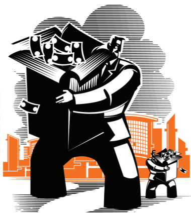
ILLUSTRATION: AJAY MOHANTY