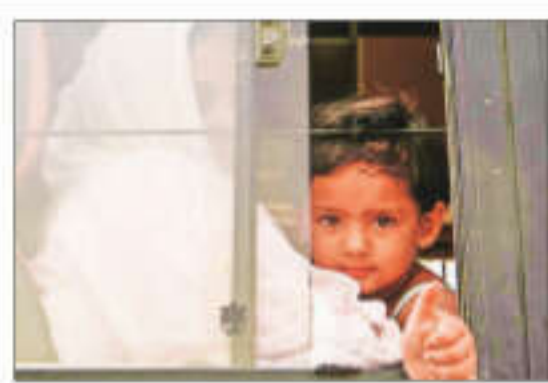
A child at the Attari-Wagah border checkpoint on Wednesday

■ Pakistan has been violating the ceasefire ever since April 23, the day after the Pahalgam terror attack