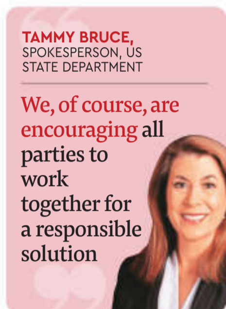
TAMMY BRUCE, SPOKESPERSON, US STATE DEPARTMENT

“Every day action is being taken. In this case, the Secretary speaking directly to his counterparts in India and Pakistan... We expect... the impact he has usually had with the individuals he has spoken with, and certainly with President Trump's leadership, India