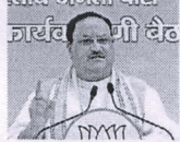
New Delhi, Ahead of electioneering for the upcoming assembly elections

In Bihar, BJP chief JP Nadda on Saturday chaired a virtual meeting, in which party leaders in the State who are MPs were present. Bihar BJP President Sanjay Jaiswal said that every MP will visit two panchayats every day in September to prepare for the elections. Jaiswal further said that all the MPs will also meet the district officials separately. "There will be virtual