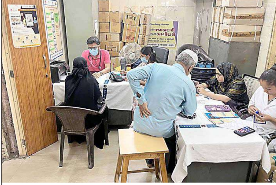
UN Mehta Institute of Cardiology & Research Centre, in collaboration with Kalapur UHC and Ahmedabad Municipal Corporation Health Department, organized a dedicated cardiac medical camp to promote heart health and awareness in Ahmedabad.

New Delhi, May 30 (IANS) Depression can significantly raise the risk of dementia both in middle age as well as among those aged 50 and above, according to a study. Dementia affects over 57 million people globally. There is currently no cure, so identifying and treating the factors to reduce the risk, such as depression, is an important public health priority. The findings showed that potential links between depression and dementia are complex and may include chronic inflammation, hypothalamic-pituitary-adrenal axis dysregulation, vascular changes, alterations to neurotrophic factors, and neurotransmitter imbalances. Shared genetic and behavioural-related modifications may also increase the risks. The study, published in the journal eClinicalMedicine, highlights the importance of recognising and treating depression across the life course, not just for mental health, but also as part of a broader strategy to protect brain health.