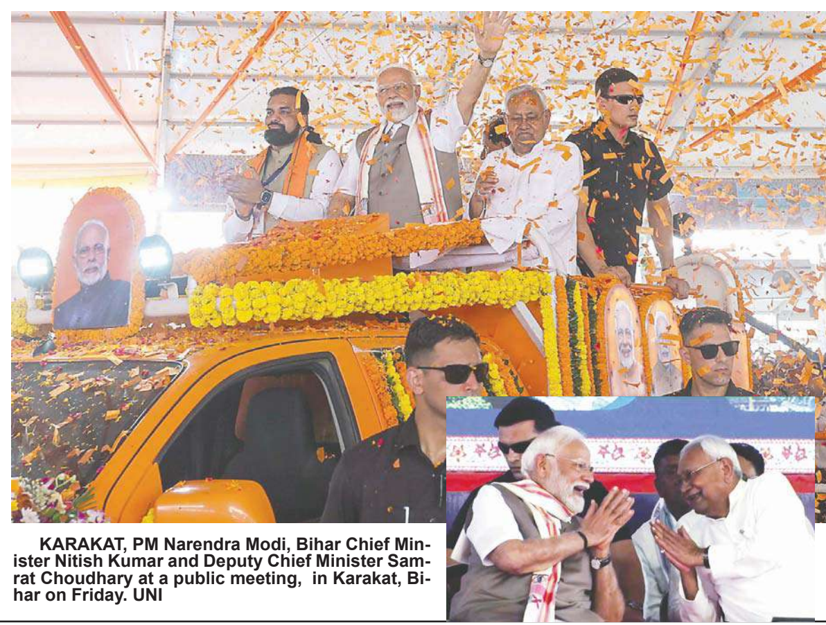
KARAKAT, PM Narendra Modi, Bihar Chief Minister Nitish Kumar and Deputy Chief Minister Samrat Choudhary at a public meeting, in Karakat, Bihar on Friday.