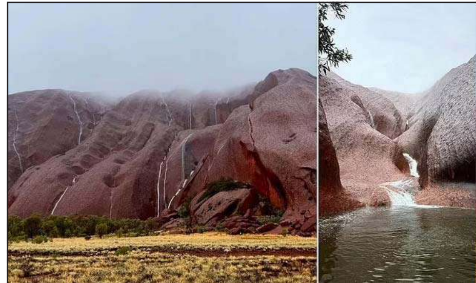
Stunning footage has captured the moment Uluru became a waterfall after rain produced cascades down Australia's sacred rock.