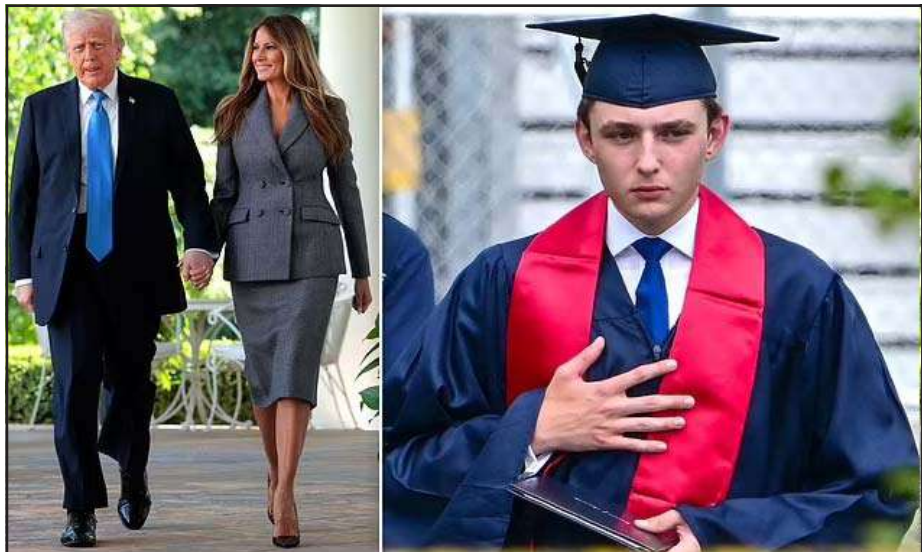
The internet caught hold of a vicious rumor that President Trump had set his sights on destroying Harvard after rejecting his 19-year-old youngest son. Now, the shocking source of the rumor has been revealed.