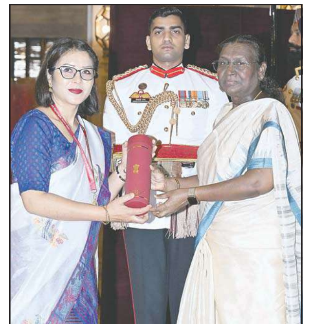
NEW DELHI, President Droupadi Murmu presenting the National Florence Nightingale Awards for the year 2025 to the nurses at a function at Rashtrapati Bhavan, in New Delhi on Friday.