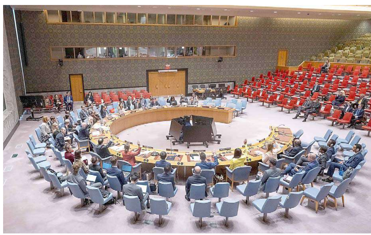
UNITED NATIONS, Representatives vote on a draft resolution during a UN Security Council meeting at the UN headquarters in New York, on May 29, 2025. The Security Council on Thursday adopted a resolution to extend the authorization for UN member states to inspect vessels suspected of Libya arms embargo violation.UNI