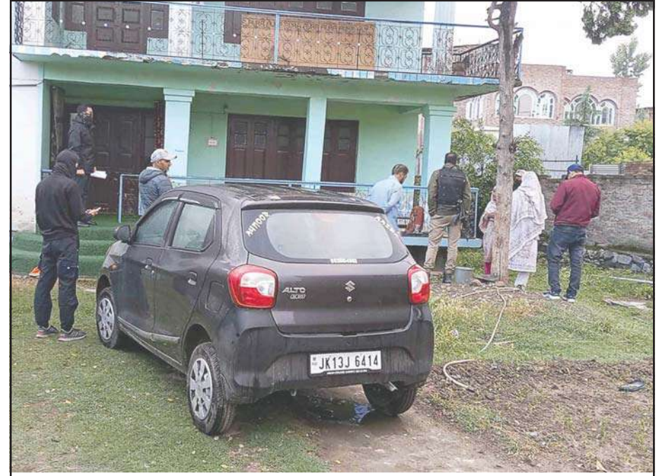
Counter Intelligence Kashmir - CIK of Jammu and Kashmir Police, conducts searches at various locations across Kashmir on Friday.