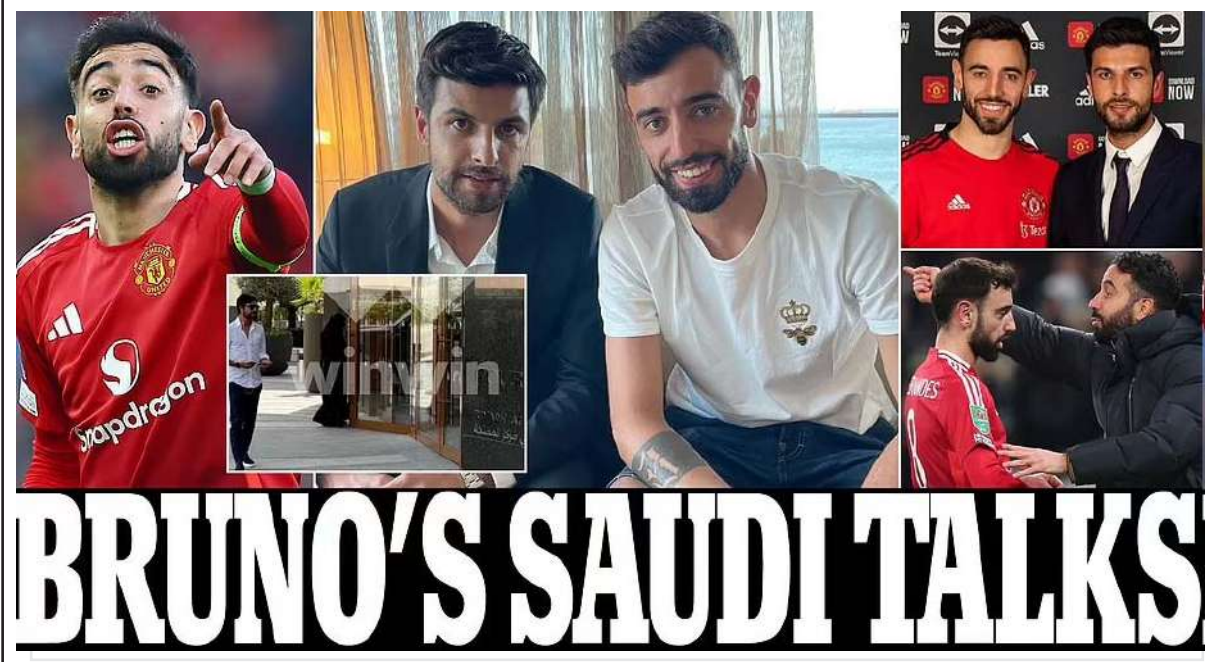
Bruno Fernandes' agent held face-to-face talks with Al-Hilal at a hotel in Riyadh on Thursday night over a mega-money deal for the Manchester United captain. It emerged on Monday that the Saudi Pro League club had given Fernandes a final 'take it or leave it' offer and told the Portugal star he had 72 hours to decide if he wants to join them.