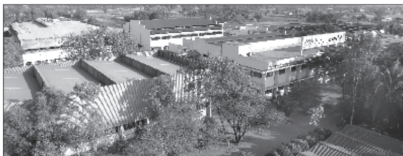
Menon Pistons Limited main manufacturing facility at Kolhapur.