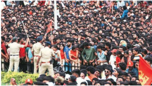
Fans gather during Royal Challengers Bengaluru's felicitation ceremony after the team's maiden IPL title win, in front of Vidhana Soudha in Bengaluru on Wednesday

The BCCI said the turn of events was shocking and the organisers