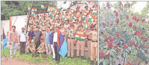
बीड जिल्ह्याच्या साधारणपणे ४ टक्केच वनक्षेत्र आहे. पर्यावरणाचा रक्षक बांधवण्यासाठी 'आक्सिजन फार्क' ची भागीदारी केली. येथे मुक्तिसंग्रामातील २४४ हुतात्म्यां आणि शहीद जवानांच्या स्मृती वृक्षांपाठोपाठ जाणवत्या जाणावत. कागूर, सिंदूर, कुसुमसह अनेक देशी आणि दुर्मीळ वृक्ष आढळून येतात.

छत्रपती संभाजीनगर : हैदराबाद मुक्तिसंग्रामातील २४४ हुतात्म्यांचे आणि शहीद जवानांचे स्मरण म्हणून अंबाजोगाईतील योगेश्वरी शाखेच्या परिसरात वर्षभरात आणखी एक हजार वृक्षांची लागवड करण्यात आली आहे. हा उपक्रम गावठी जागतिक प्रतिबंधक दिनाच्या निमित्ताने योगेश्वरी प्रांत आर्मांकडून राबवण्यात आला. १७ सप्टेंबरपर्यंत वृक्षांरोषाचे विशेष अभियान राबवण्यात येते. योगेश्वरी संस्थेच्या ३५, एकर परिसरात मागील काही वर्षांत १२५ प्रजातीतील पाच हजार वृक्ष लागवडाला आले आहेत. त्याला 'शहीद स्मृती आक्सिजन फार्क' म्हटले जाते. यापैकी वड, पिंपळ, लिंबू, चिंचू या पारंपरिक वृक्षांसह कागूर, शेंदूर, कुसुम, रत्नसुम, हिरडा, बेहडा, पारोबा वृक्ष अशी पाच हजारभर वृक्ष येथे पाहिल्या जातील. मुख्य म्हणजे जवळपास सर्वच वृक्ष हे हरी असेल.