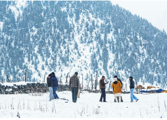
Tourists witness light snowfall amid snow-covered mountains and meadows, in Sonamarg

predicting generally dry weather till January 20, the prospect of a major snowfall during the ongoing 40-day period of Chillai Kalan appears bleak.