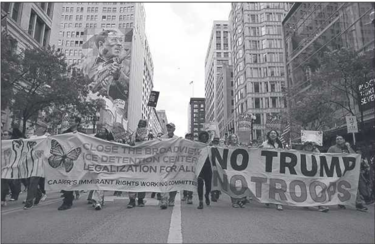
People march during Illinois Coalition for Immigrant & Refugee Rights' "Chicago Says No Trump No Troops" protest in Chicago.

Singhal also urged the entire international community to support Afghanistan. While more and more people arrive in Afghanistan from Pakistan and Iran, the population of the country faces such issues as malnutrition and extreme levels of food insecurity, which creates additional vulnerability and challenges for humanitarian workers, he said.A 6.0 magnitude earthquake shook eastern Afghanistan around midnight on August 31. It was followed by aftershocks. On Thursday, the Ariana News portal reported that the death toll from the earthquake in Afghanistan exceeded 2,200, with over 3,600 people injured.