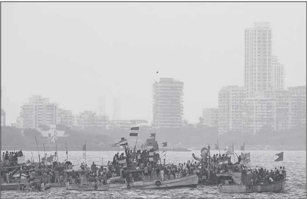
People on boats take part in procession of 'Lalbaugcha Raja' idol of Lord Ganesha before visarjan, immersion, during the 'Ganesh Chaturthi' festival, at Girgaum Chowpatty, in Mumbai.