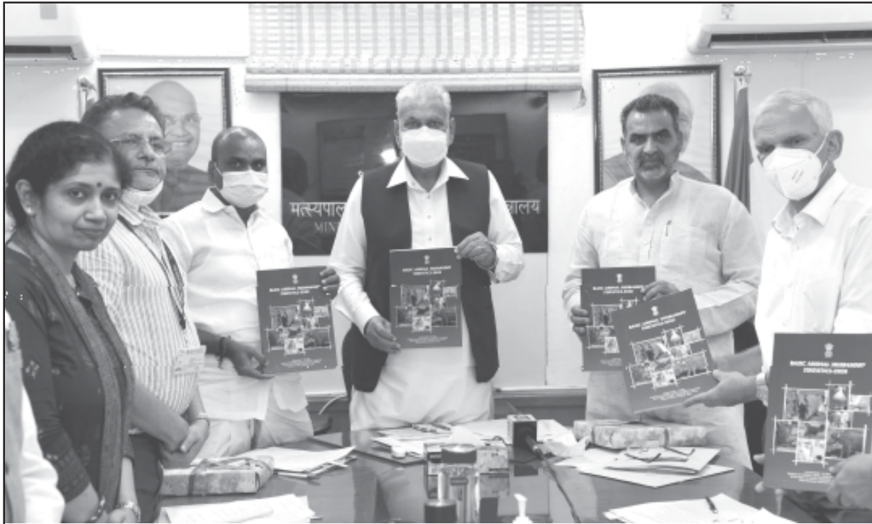
The Union Minister for Fisheries, Animal Husbandry and Dairying, Shri Parshottam Rupala at the virtual review meeting on the implementation of a special livestock sector packages and schemes with all the States & UTs Ministers, in New Delhi. The Minister of State for Fisheries, Animal Husbandry and Dairying, Shri Sanjeev Kumar Balyan and the Minister of State for Fisheries, Animal Husbandry & Dairying, Information and Broadcasting, Dr. L. Murugan are also seen.

Mr. Qureshi (81), is a senior Congress leader and had served as the Governor of Mizoram from 2014 to 2015. He also had charge of Uttar Pradesh for some time. Police said action will be taken according to the law.