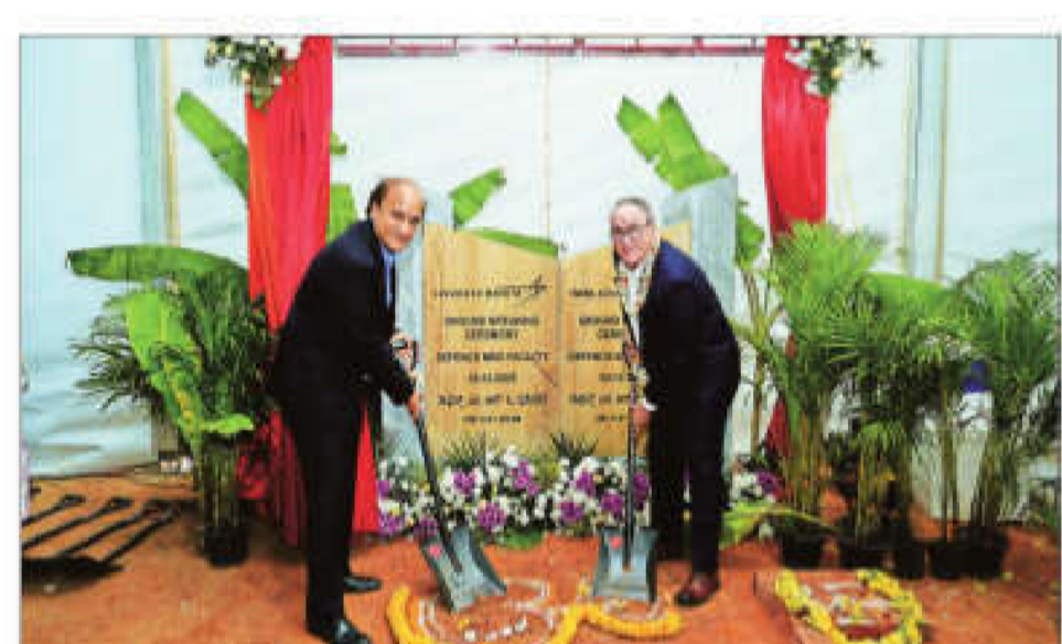
The MRO is set for completion by late 2026, with the first C-130 arriving for maintenance in early 2027

The groundbreaking ceremony brought together senior officials from the Indian Air Force (IAF), government dignitaries, industry leaders and senior executives from Lockheed Martin