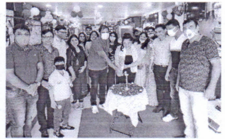
Staff reporter, Guwahati August 10: