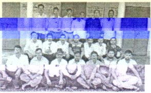
Correspondent, Orangi, August 10: