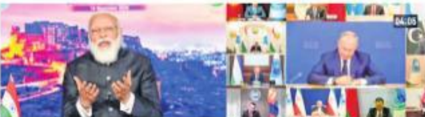
PM Narendra Modi addressing the 20th SCO summit, via video conferencing, in New Delhi on Tuesday

The remarks by Modi came in the backdrop of the Sino-India border row in eastern Ladakh and Chi-