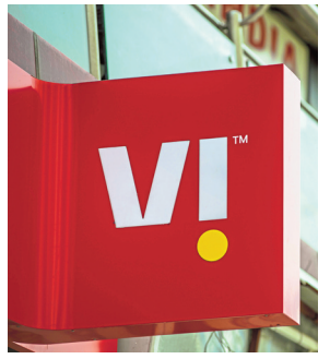
VI has been able to retain its 21 mn postpaid user base.

Queries sent to Vodafone Idea didn't elicit a response.