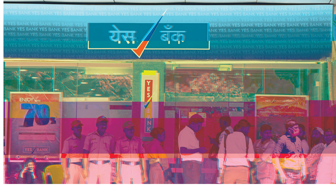
As part of Yes Bank's restructuring in March 2020, RBI along with Yes Bank administrator decided to write off the AT1 bonds.

A copy of RBI's petition was seen by Mint. RBI, along with Yes Bank, filed