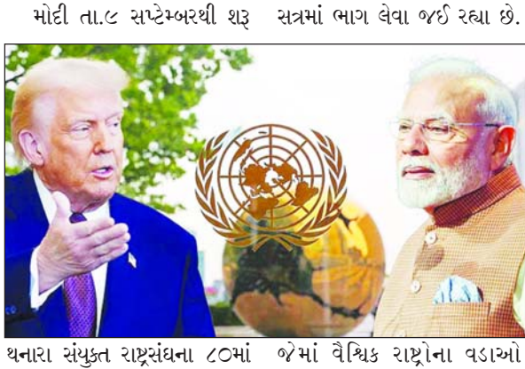
મોદી તા.૮ સપ્ટેમ્બરથી શરૂ કરવામાં આવેલા સત્રમાં ભાગ લેવા જઈ રહ્યા છે. તા.૨૩થી૨૮ ડિસેમ્બર ચાલશે. તા.૨૬ સપ્ટેમ્બરે વડાપ્રધાન મોદી સંબોધન કરી શકે છે અને મોદીના ન્યુયોર્ક રોકાણ સમયે અનેક વૈશ્વિક નેતાઓ પણ ન્યુયોર્કમાં મોજૂદ હશે. જેમાં તમામ અમેરિકાના પ્રમુખ ડોનાલ્ડ ટ્રમ્પને પણ મળી શકે છે અને આ બેઠક બન્ને દેશો વચ્ચેના સંબંધોમાં નિર્ણાયક બની શકે છે. મોદી અગાઉ કેનેડામાં યોજાયેલી ૭-૮ દેશોની બેઠકમાં હાજરી આપવા પહોંચ્યા હતા પણ

નવી દિલ્લી તા.૧૩ અમેરિકાએ ભારત પર લાદેલા ૫૦% ટેરીફના તનાવ તથા અમેરિકા-પાકિસ્તાની વધતી જતી નજદીકીયા વચ્ચે હવે આગામી મહિને વડાપ્રધાન શ્રી નરેન્દ્ર મોદીની સંભવિત અમેરિકા મુલાકાત અને પ્રમુખ ડોનાલ્ડ ટ્રમ્પ સાથે પણ તેઓ ટેરિફ સહિતના મુદ્દે વાટાઘાટ કરી શકે છે તેવા સંકેત મળતા વ્યાપાર-ઉદ્યોગ સહિતના ક્ષેત્રે આશાનો સમકારો જોવા મળી રહ્યો છે.