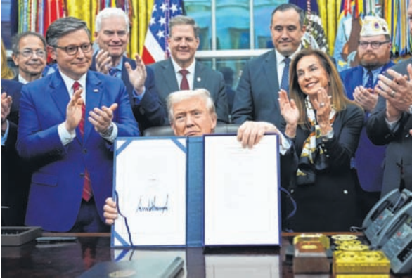
President Donald Trump displays the signed funding bill to reopen the government, in the Oval Office of the White House on Wednesday in Washington.

The signing came shortly after the House of Representatives approved the funding package 222-209, following the Senate’s earlier passage. Nearly all Republicans and a few Democrats voted in favor, ending weeks of bitter deadlock over an Obamacare-related program opposed by Repub-