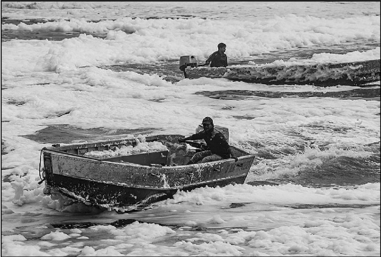
People ride boats in the polluted Yamuna river, in New Delhi.