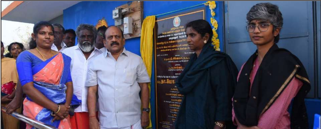
A newly constructed Anganwadi building built at a cost of Rs.14.31 lakh under the All Village Anna Rejuvenation Scheme, in at Pazhayannur Panchayat in Maduranthagam Panchayat Union, Chengalpattu district, was inaugurated by the MSME Minister Thamo. Anbarasan in the presence of District Collector Thiru. (Ms.) T. Snega. Minister also inaugurated Anganwadi building built at a cost of Rs.16.45 lakh in Eesur village in Boothur Panchayat, Maduranthagam Panchayat Union, unveiled the foundation plaques of seven newly constructed Anganwadi buildings built on behalf of the Rural Development and Panchayat Raj Department. MLAs, local body representatives, officials were present at the event.

Growth was largely fuelled by non-metro regions, accounting for 95% of new users. Virtual gifting surged with 974 million gifts exchanged, while weekends and festivals such as Diwali saw peak usage, including a record 4.04 lakh video conversations in a single day.