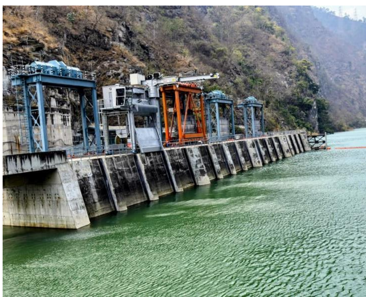
Punatsangchhu-II HEP, Bhutan