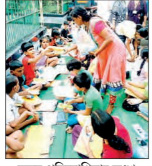
অক্ষয় প্রতিযোগিতায় অংশ নিয়েছে শিশুরা।