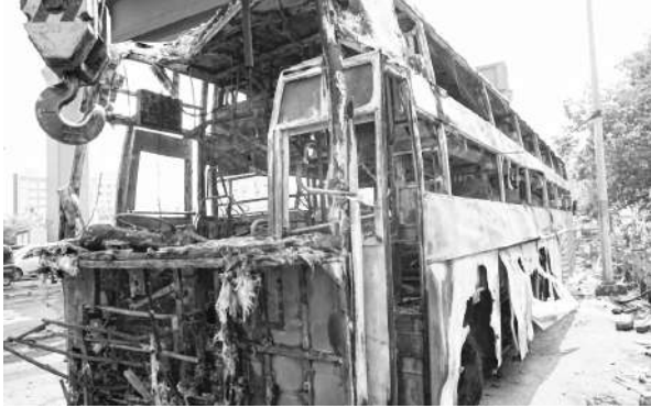
The burnt down bus in Kurar village – Vijay Gohil

electric wiring, electrical installations, fans, irons, steamers, wooden furniture, a sewing machine, garments, steel racks, office files, and other items in a 1,000 sq ft area in Gala 209 on the second floor of the industrial estate,” said a report by the BMC disaster management cell.