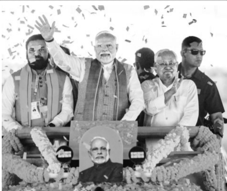
Prime Minister Narendra Modi and Bihar Chief Minister Nitish Kumar during a public meeting in Siwan on Friday

Prime Minister Narendra Modi on Friday launched 28 development projects worth more than ₹5,900 crore in Bihar's Siwan district and 105 projects valued at over ₹18,600 crore in Odisha.