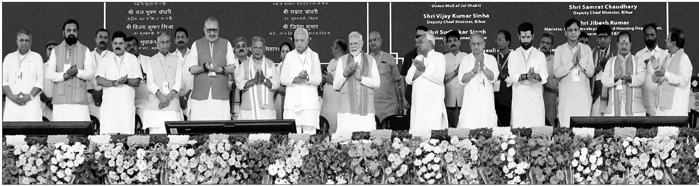
सीवान के जसौली में आयोजित प्रधानमंत्री के कार्यक्रम में हिस्सा लेते बिहार के राज्यपाल, मुख्यमंत्री सहित कई नेतागण।