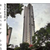
The residents can return after OC is granted, high court said

Mumbai: Dubbing them "a selfish lot" who are not bothered about people's lives, Bombay high court has directed occupants of a 34-storey Tardeo tower's top 18 floors that do not have an occupation certificate (OC) to vacate their flats in two weeks.