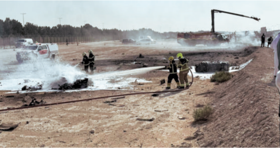
Emergency services attend the scene after a HAL Tejas crashed during a demonstration at the Dubai Airshow, at Al Maktoum International Airport at Dubai World Central

This is the second-known peacetime incident, involving a Tejas, the 4.5-generation fighter jet manufactured by the Indian company Hindustan Aeronautics Ltd.