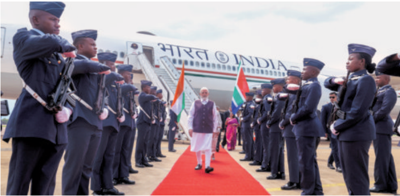
PM Narendra Modi being accorded a traditional welcome upon his arrival to attend the G20 Summit, in Johannesburg, South Africa

The PM said he is looking forward to interacting with leaders of partner countries, and participation in the 6th India-Brazil-South Africa (IBSA) summit scheduled on the sidelines of the G20 summit. The PM will also interact with the Indian diaspora in South Africa, which he said is one of the largest outside