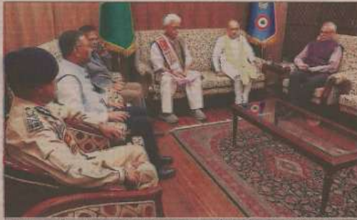
Union home minister Amit Shah being briefed by Jammu & Kashmir CM Omar Abdullah, LG Manoj Sinha and other high-level officials on the Pahalgam terrorist attack, in Srinagar on Tuesday

Cutting short all engagements, Union home minister Amit Shah rushed to Srinagar to take stock of the situation