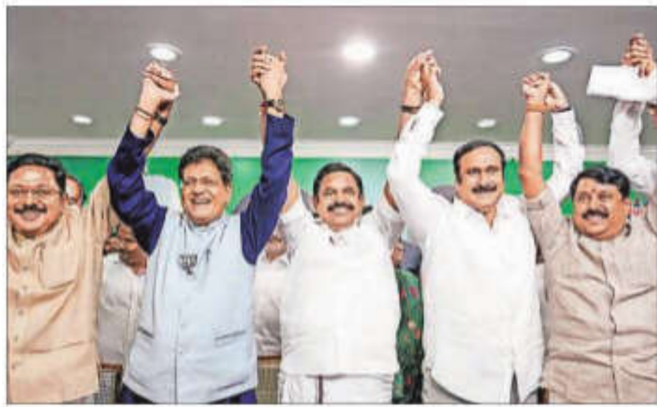
Union Minister Piyush Goyal along with AIADMK General Secretary Edappadi K. Palaniswami, Pattali Makkal Katchi (PMK) MP Anbumani Ramadoss and others join hands during a press conference ahead of the Tamil Nadu Assembly Elections, at the party headquarters in Chennai on Monday

Asked about the number of seats to be contested by AIADMK, Palaniswami said