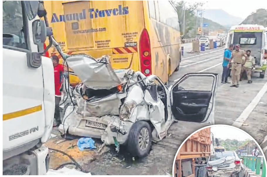
Raina Assainar NAVI MUMBAI

Four injured; a truck, 3 buses and 3 cars involved