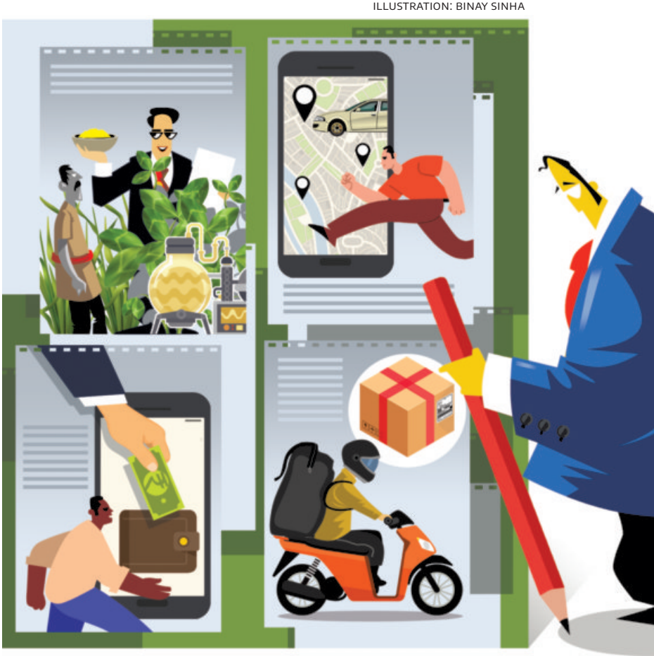
ILLUSTRATION: BINAY SINHA

These codes are also instrumental in capturing economic activity through statistical surveys such as the Annual Survey of Industries, informal sector surveys, the Economic Census, and the Ministry of Corporate Affairs (MCA) database. They further support economic research, registration processes,