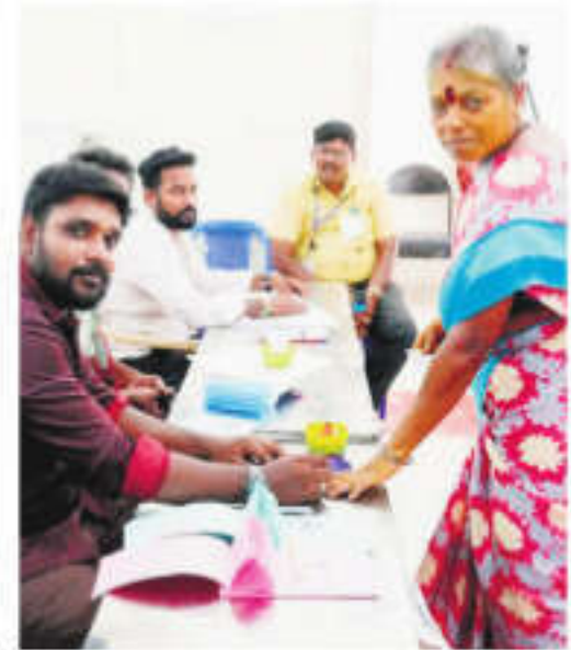
A street vendor casting her vote at Tondiarpet election booth

The turnout in Royapuram was 3,492 (44.2%) and Kodambakkam 2,994 (52.49%). Manali saw a 49.4% turnout and