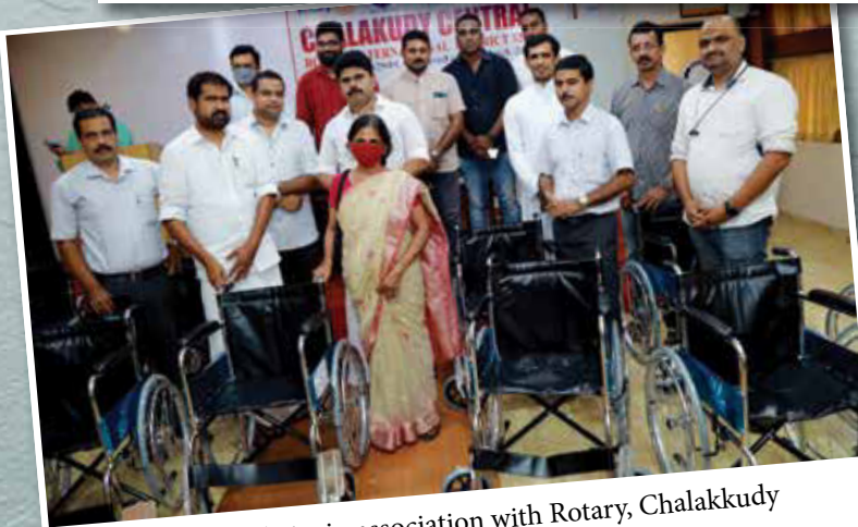
Donating wheel chairs in association with Rotary, Chalakkudy