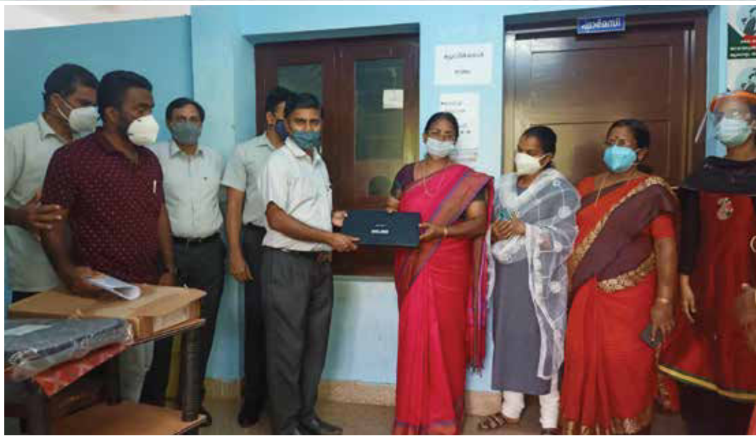
Donating Laptop to Public Health Centre , Kathikudam to support Covid vaccination for public