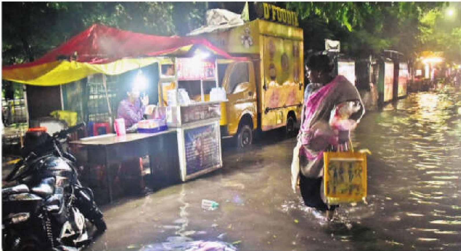
Rainwater stagnated at Shenoy Nagar on Tuesday evening following incessant rain in the city; (Below) Deputy Chief Minister Udhayanidhi Stalin inspecting the desilting of canals at Keelkattalai on Tuesday

complained of sewage-mixed rainwater along Gokilambal Nagar main road, blaming poor desilting of stormwater drains. After some media coverage, officials cleared the water, but residents alleged that sewage sludge was dumped with an earthmover on nearby vacant land at Gokilambal Nagar 2nd cross street exit area, which is already facing stagnation.