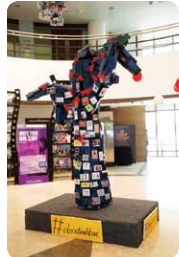
Blood Donation Camp at Whistling Woods International

WWI has joined hands with Reliance Jio to launch the WWI Virtual Reality Lab. VR / AR is expected to be the next major driver in the Media and Entertainment industry and WWI has taken the lead by looking to create the methodology to learn and deliver education in this area. The Lab will be producing content for Reliance Jio's Jio Cinema platform and experimenting with various filmmakers to push the boundaries of this technology in storytelling.