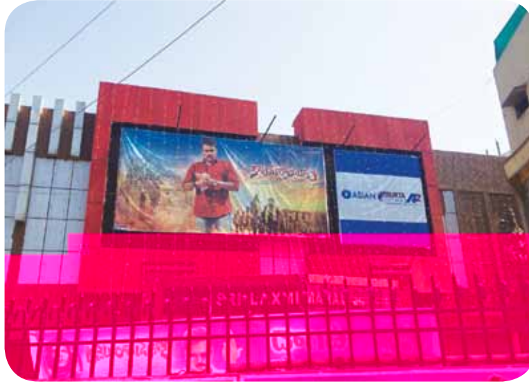
Mukta A2 Cinemas with South's Asian Cinemas

The company though did open new screens in its JV with Asian Cinemas in the Andhra region. The count in this JV now stands at 8 screens which are performing strongly given the access to top content from that region.