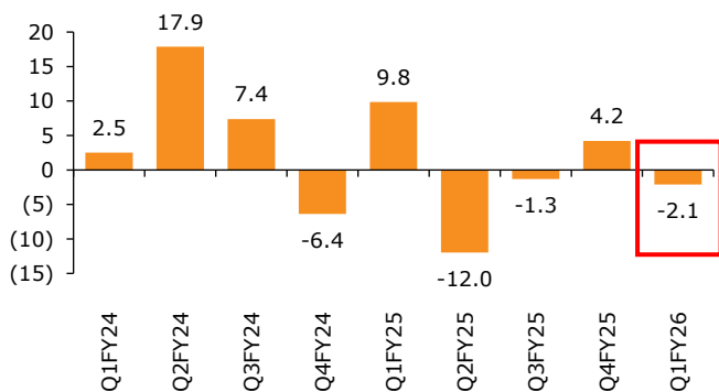
Domestic MHCV Industry Growth YoY (%)