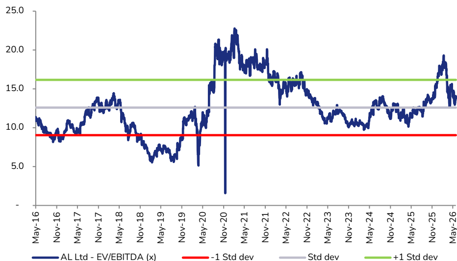
Exhibit 5: One year forward EV/EBITDA